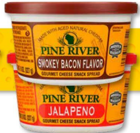
6901 - Smokey Bacon Golden cheddar cheese accented with hickory smoked bacon flavor. $13