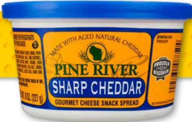
6900 - Sharp Cheddar This buttery sharp cheddar cheese spread is our most popular flavor. $13