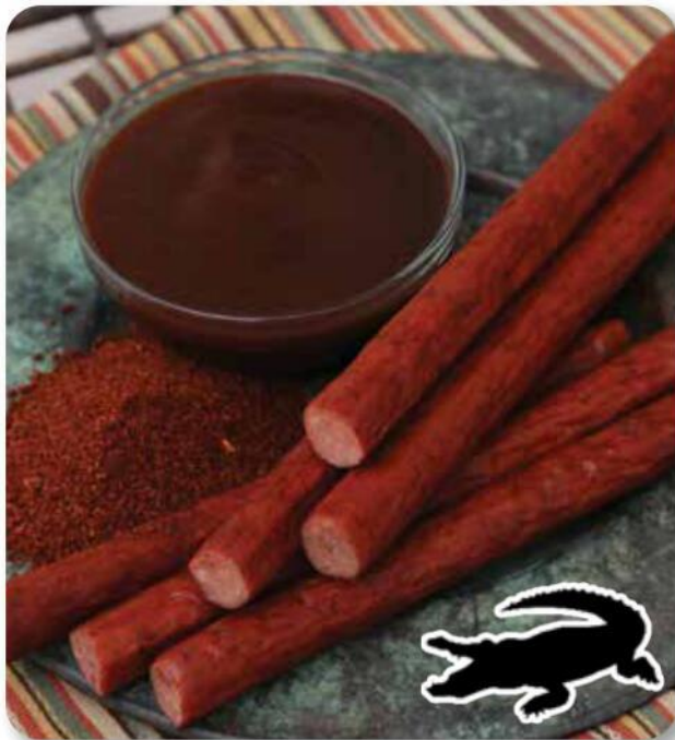
7146 - Cajun Honey BBQ Gator Snack Sticks Gator and pork done up in a special Louisiana-style seasoning. Gluten free. 7 ounces. $20