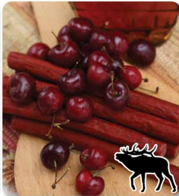
7147 - Cherry Maple Elk Snack Sticks Lean cuts of elk and a special selection of pork, maple and cherry flavor. Gluten free. 7 ounces. $20