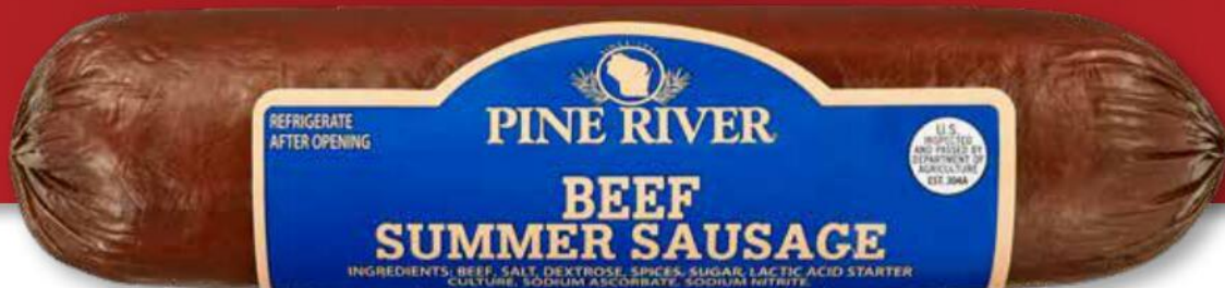
7143 - Individual Size Beef Summer Sausage Protein-packed snack made with the best beef and spices. Gluten free. 5 ounces. $13